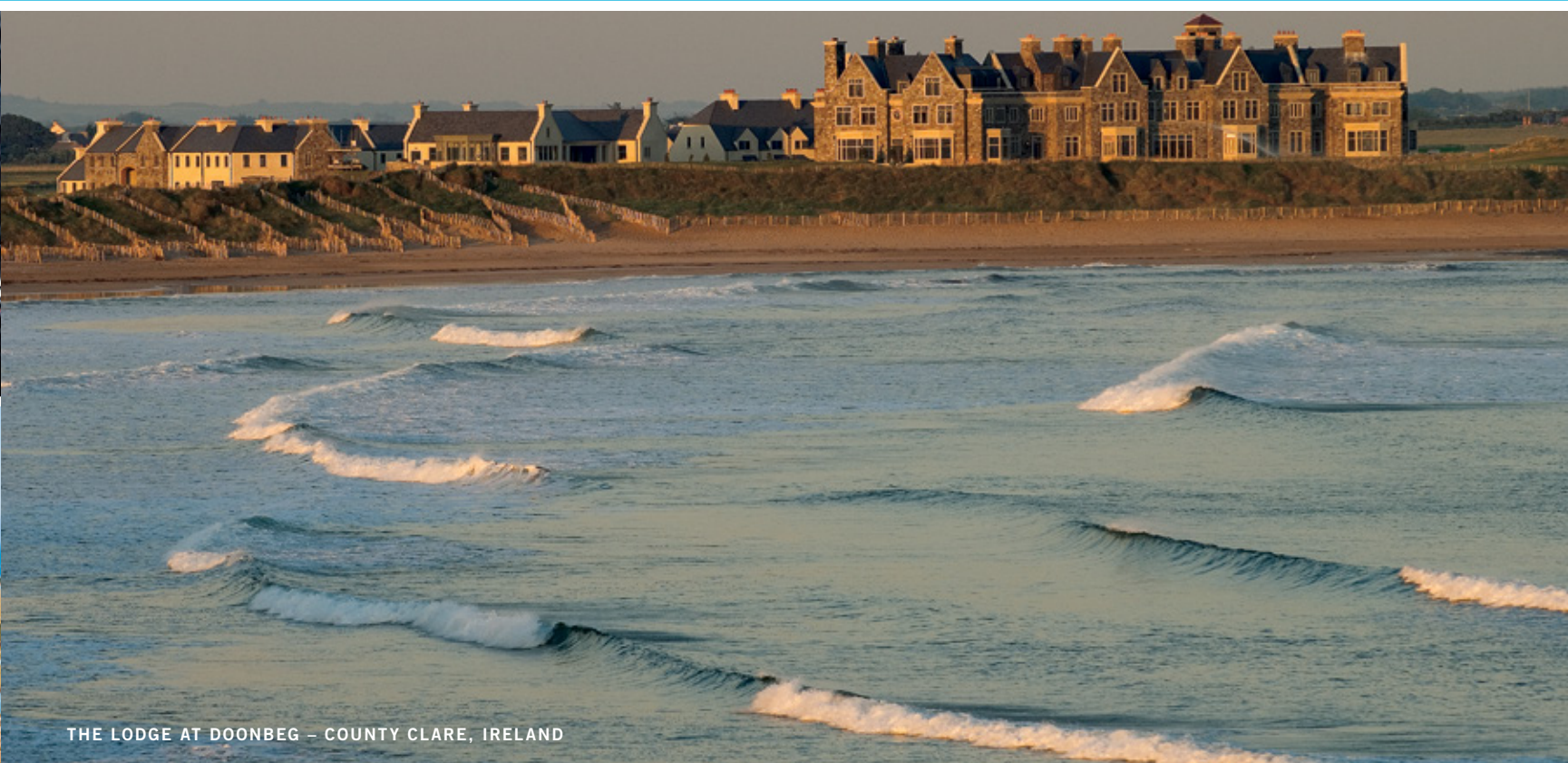
THE LODGE AT DOONBEG – COUNTY CLARE, IRELAND