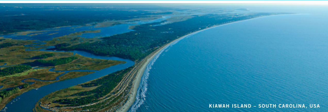
KIAWAH ISLAND – SOUTH CAROLINA, USA