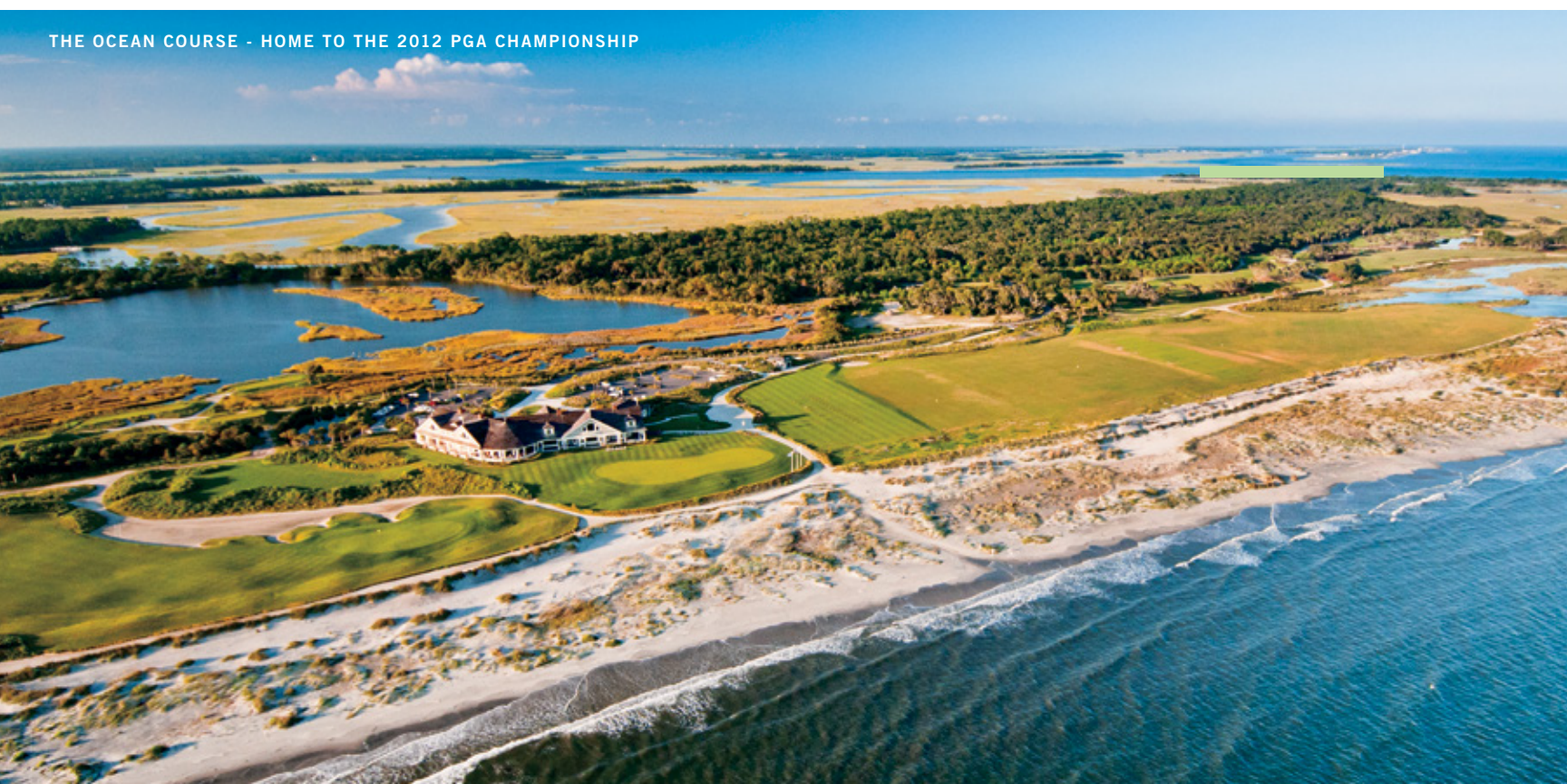
THE OCEAN COURSE - HOME TO THE 2012 PGA CHAMPIONSHIP